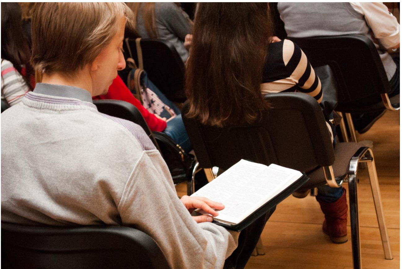
At the evening youth worship service at Fimiam Church